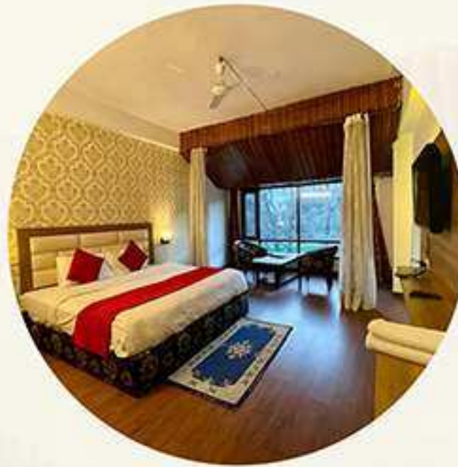
Super Deluxe Rooms

These rooms offer a private sit-out area and stunning river views.