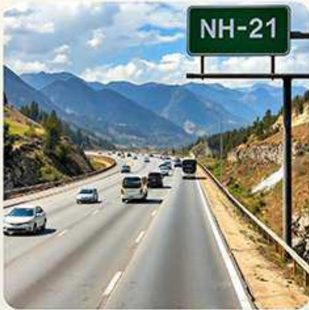
National Highway 21

Hotel Sitara International is ideally situated on National Highway 21, Rangri, Manali. Enjoy spectacular mountain views along the Beas River, just minutes from Mall Road and major attractions, in a peaceful, pollution-free environment.