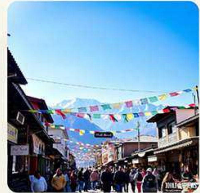
Mall Road Proximity

Scenic riverside setting with mountain views.