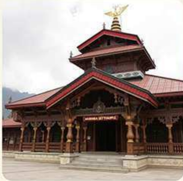
Hadimba Devi Temple